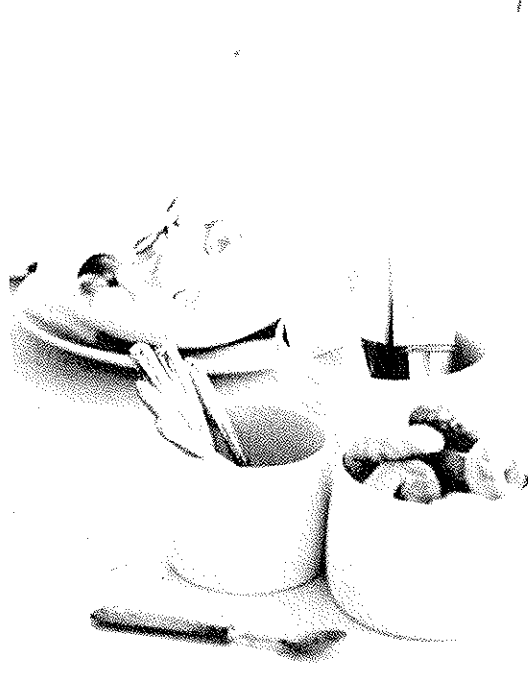
Top left / Robert Gordon Ltd dinner plate, $29.95 each, and pasta bowl, $29.95 each, www.robertgordon.com.au